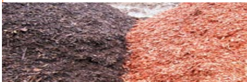
Dyed Brown & Dyed Red Mulch

Mulch can kill existing low weeds by preventing light from reaching them and, if the mulch is deep enough, (3 inches) weed seeds that germinate in the soil expire before reaching the light. Weed seeds that do germinate are easy to pull out. Weeds that arise from bulbs, tubers or perennial roots (onion weed and clover) will push through any layer of mulch!