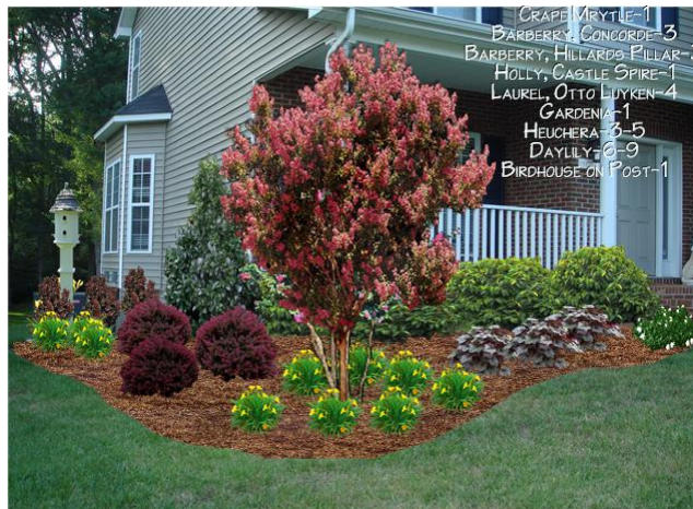
After, a well designed, well mulched landscape!