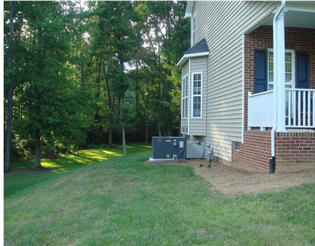
Before, a blank slate...